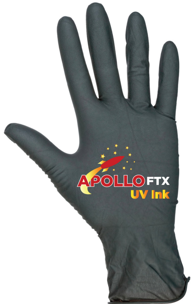
Nitrile gloves, Apollo FTX UV Ink toxicology certified as safe ASTM D 4236 (LHAMA - 16 CFR 1500.14)

White ink is handled differently from process colors for three reasons. First, it is frequently the base coat applied to hide a colored substrate or to make a translucent material opaque. For back-side printing on clear substrates, it will, of course, be last and a separate pass. Secondly, white inks and coatings depend on light scattering, not absorption. They are less efficient than