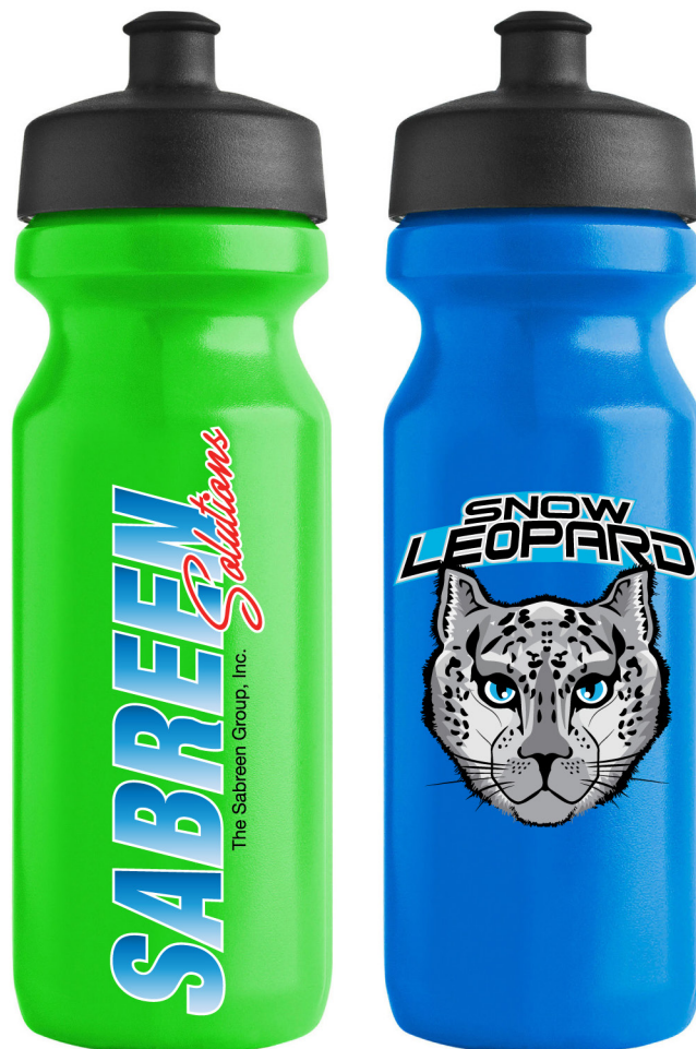
Flexible polyolefin water hydration bottles with excellent adhesion, scratch/mar and chemical resistance

Piezoelectric drop-on-demand UV inkjet printing is far more complex and delicate than analog printing. Inkjet requires the nozzles to fire precisely sized drops with exact accuracy. High-quality inkjet printing systems must simultaneously integrate printheads, fluids, controllers, pretreatment and cure. Safety